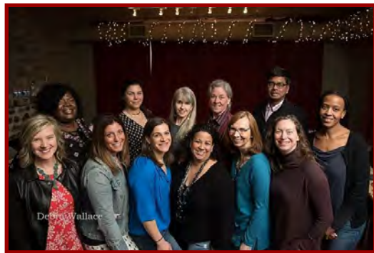
The 2018 Listen to your Mother, Rochester! Cast.

A very successful 1st Annual Volleyball Tournament was put on by our Junior Board of Young Professionals!