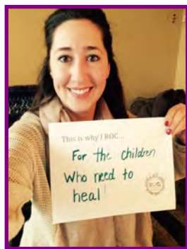
One of our FTIP therapists sharing why she ROCs the Day for SPCC.

SPCC’s annual holiday project was supported by many different groups, companies and individuals, including this Jazzercise studio. Our holiday project provides gifts to over 500 children and families served by SPCC each year.