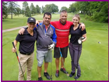
A happy foursome at the 31st Annual Children’s Classic Golf Tournament in June at Midvale Country Club!

SPCC had several fundraising events in 2018, including our 31st Annual Children’s Classic Golf Tournament, our annual Angel Party, ROC the Day, Listen to Your Mother, and the indoor Volleyball Tournament and guest bartender events hosted by our Junior Board of Young Professionals. Thank you to all of our supporters and sponsors for your generous support!