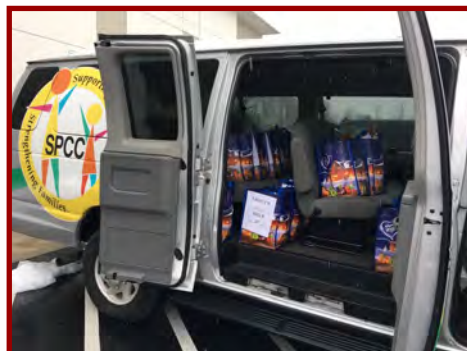
eHealth Technologies generously donated hundreds of Thanksgiving meal items for families served by SPCC’s programs—enough to fill our agency van!

Another year of giving and fun took place at Restaurant Good Luck at our annual Angel Party in December.