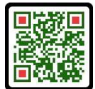
Chat with Wanda!

Scan the QR code to the right to chat with Wanda and get connected to your local WIC agency!